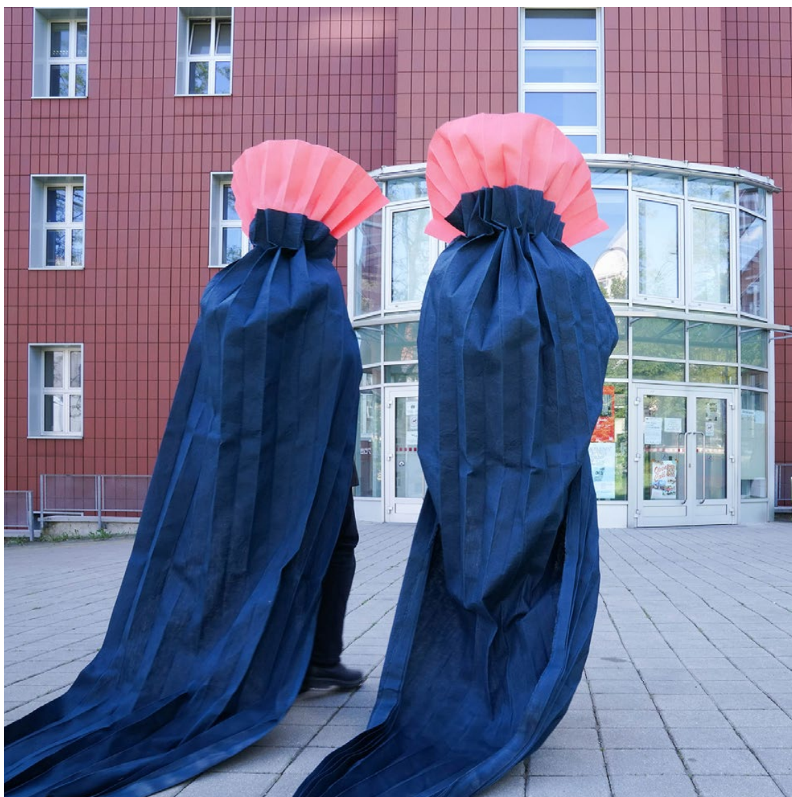
Faculty of Art and Design, Usti nad Labem C-Print, 2025