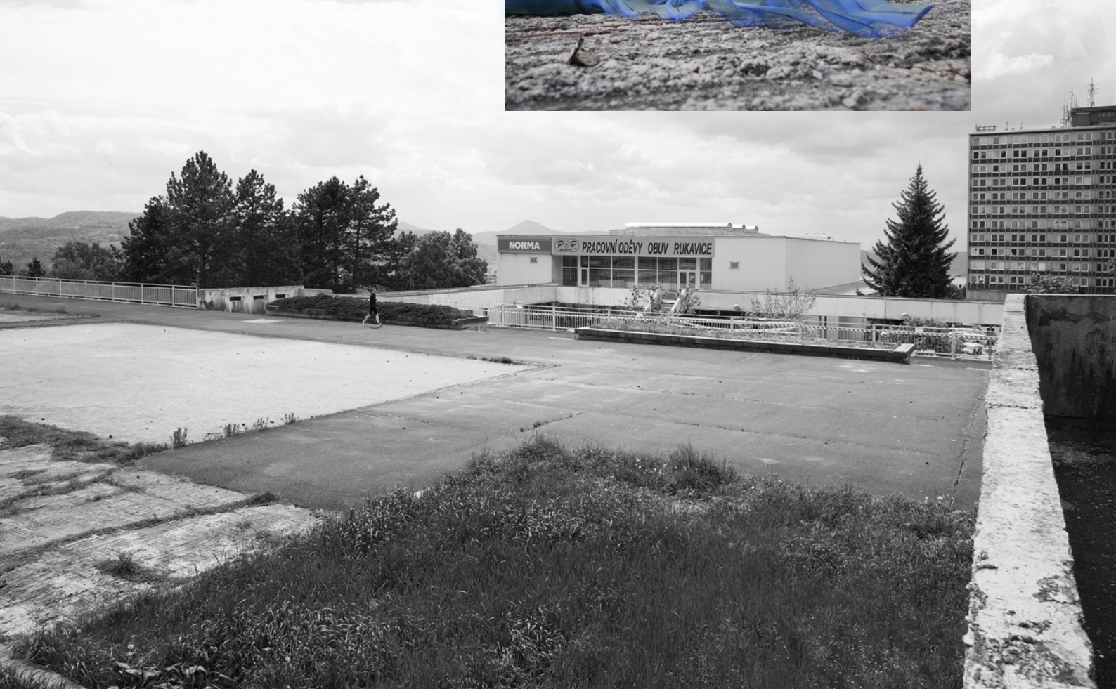
On the Northern Terrace, Ústí nad Labem C-Prints, 2025