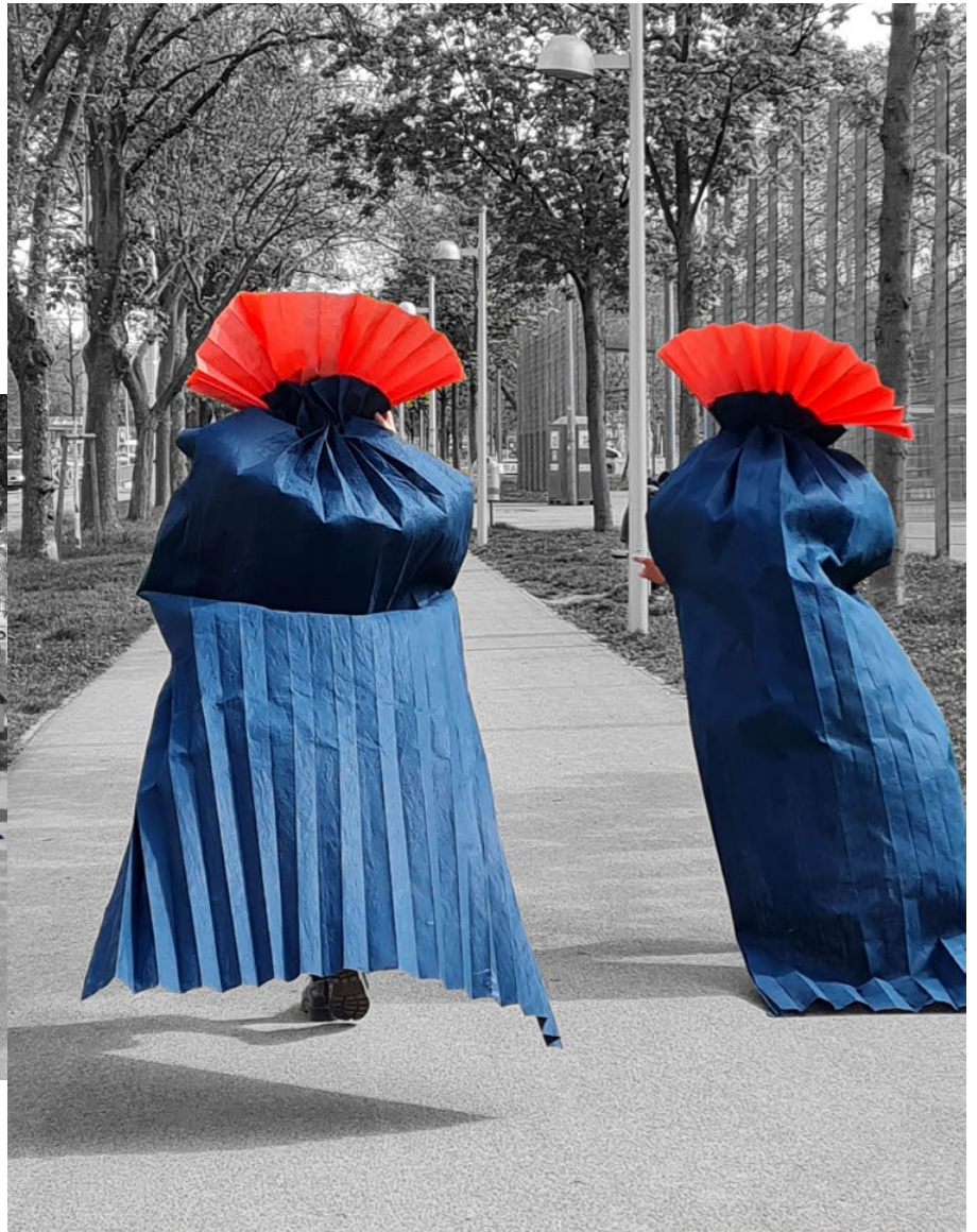
Performing, Margaretengürtel, Vienna C-Prints, 2022-2024