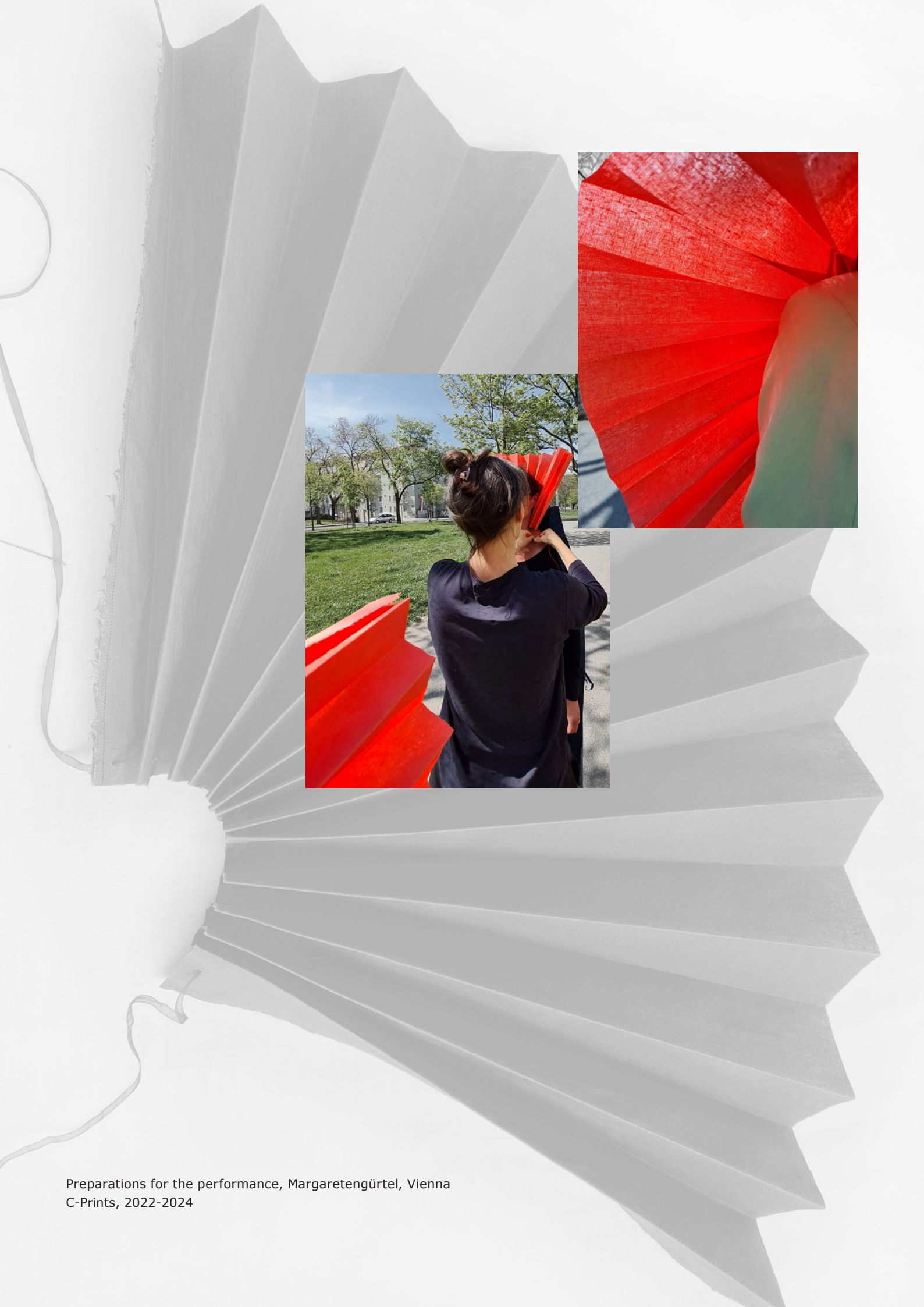
Preparations for the performance, Margaretengürtel, Vienna C-Prints, 2022-2024