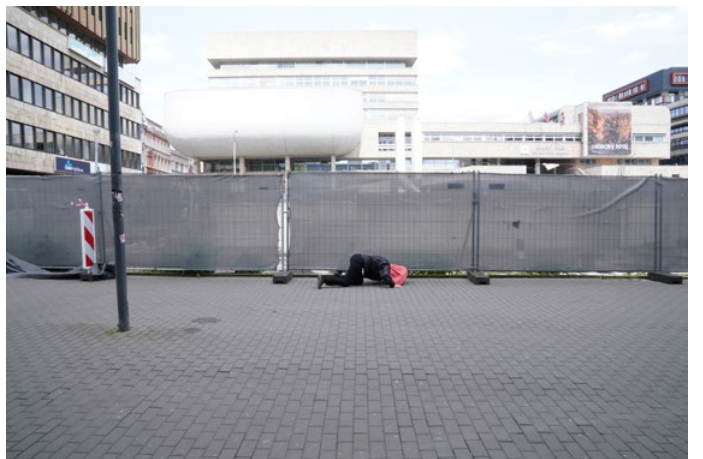
Regional Authority of the Ústí nad Labem Region (former seat of the Regional Committee of the Communist Party) C-Prints, 2025