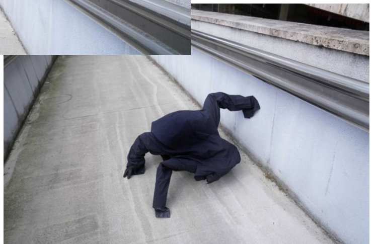
Regional Authority of the Ústí nad Labem Region (former seat of the Regional Committee of the Communist Party) C-Prints, 2025