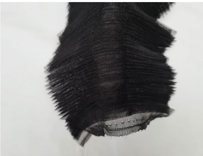
Herring and the Fuff, C-prints, textile objects, 2022-2023