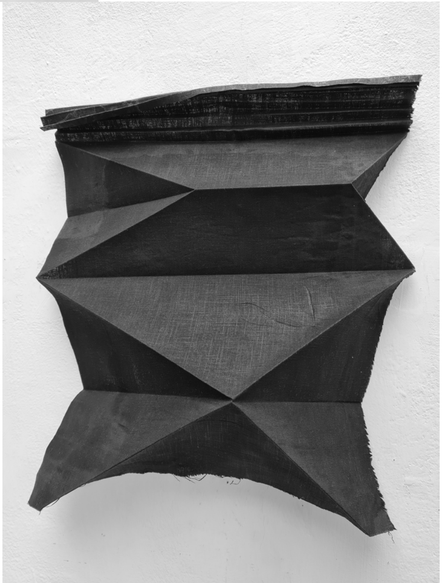
Folded textile objects, 2022/2024