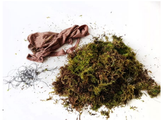
Anthropophyts /Mooshaube (moss hood) C-prints, textile object with and without moss, 2023