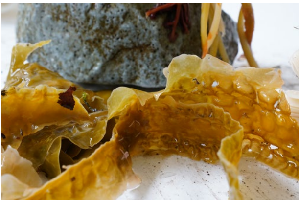
Anthropophyts c-prints/dibond, 2023 videostill, video „tie“, 2:25 min, 2024