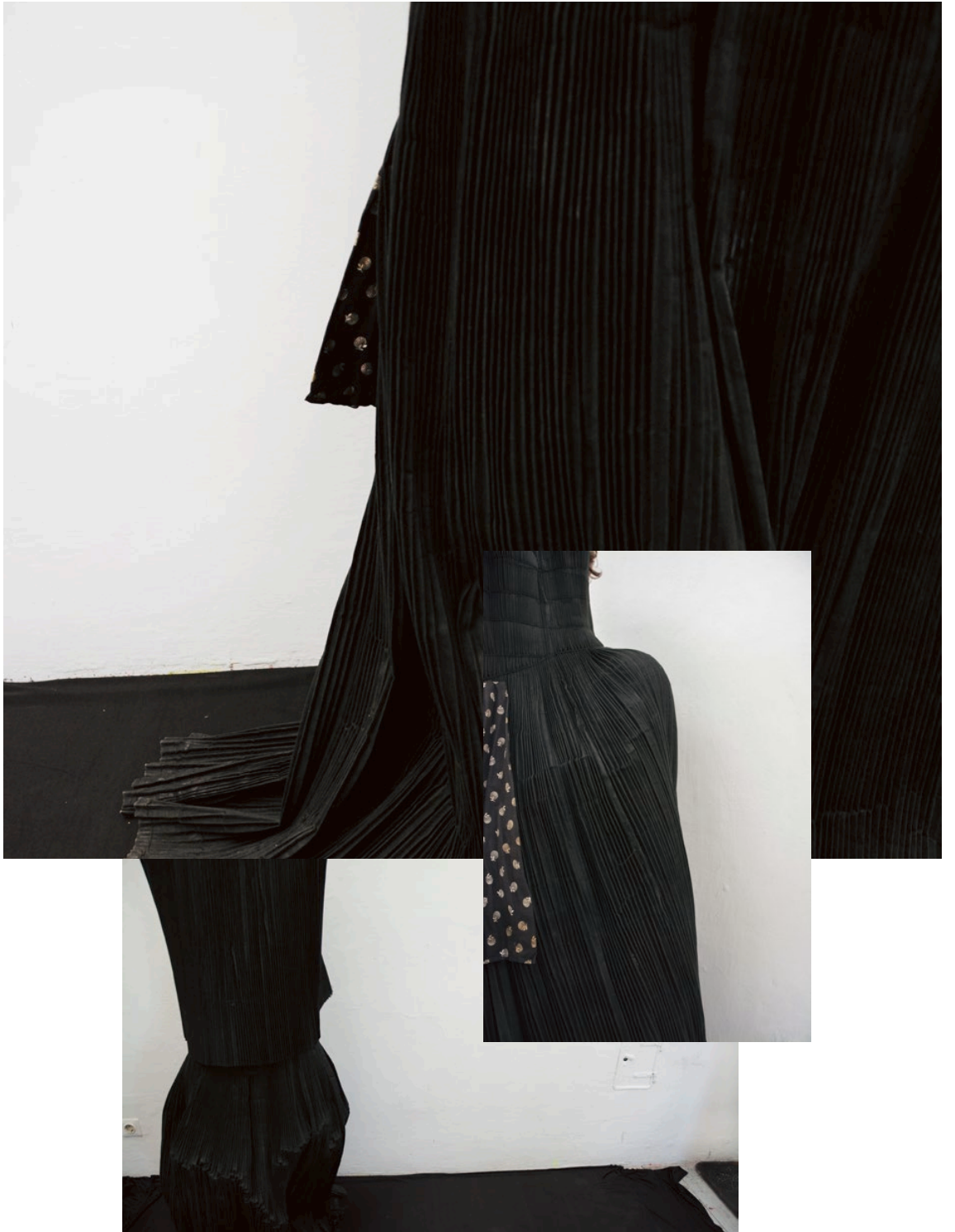
Folds C-Prints/Dibond, 2020