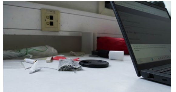
Anthropophyts in the making, 2023