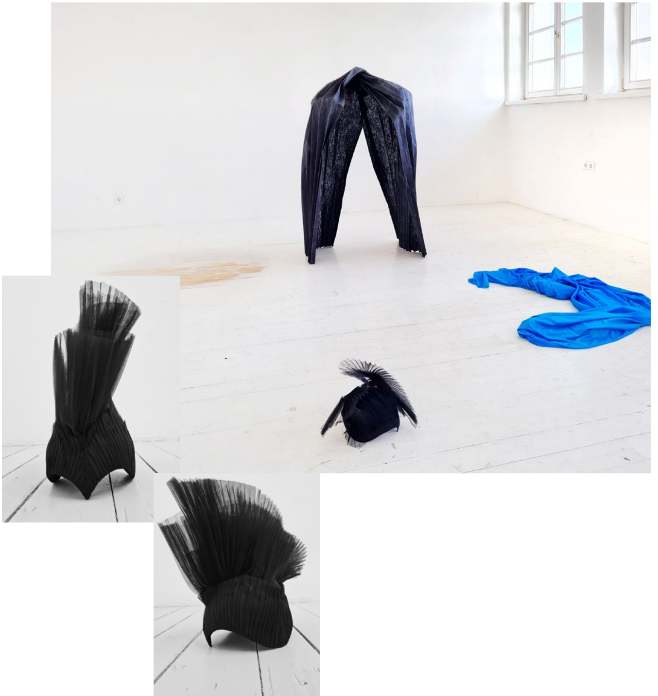
Textile objects and `Heiliggeist Haube` (Holy Spirit Hood), 2022-2023