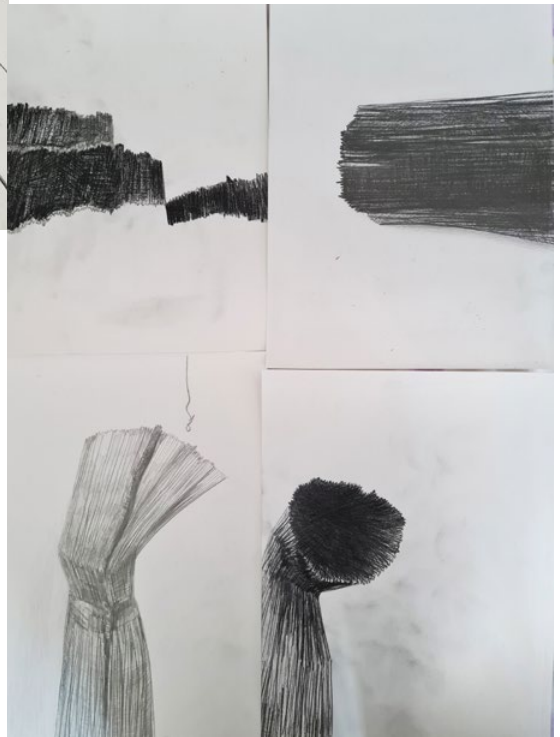
Textile objects, 2024/2025 Drawings, 2023