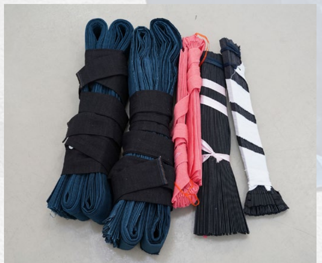
Textile, folded and unfolded, 2022/2024